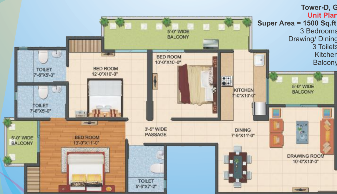
Tower-D, G Unit Plan Super Area = 1500 Sq.ft. 3 Bedrooms Drawing/ Dining 3 Toilets Kitchen Balcony