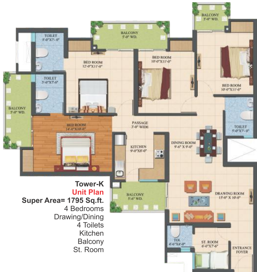
Tower-K Unit Plan Super Area= 1795 Sq.ft. 4 Bedrooms Drawing/Dining 4 Toilets Kitchen Balcony St. Room