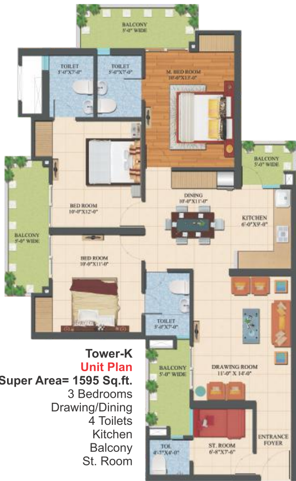
Tower-K Unit Plan Super Area= 1595 Sq.ft. 3 Bedrooms Drawing/Dining 4 Toilets Kitchen Balcony St. Room