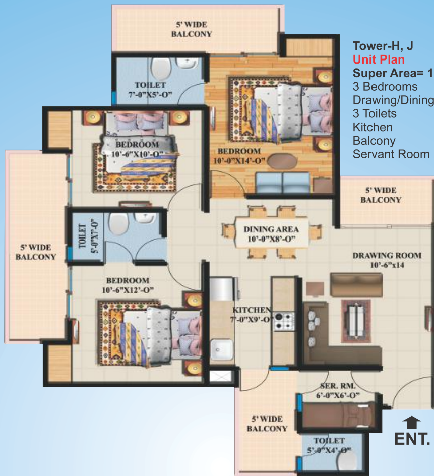
Tower-H, J Unit Plan Super Area= 1495 Sq.ft. 3 Bedrooms Drawing/Dining 3 Toilets Kitchen Balcony Servant Room